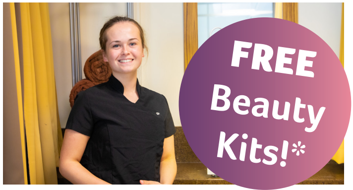
Subject to terms and conditions

We have a range of dedicated support and wellbeing services including FREE travel; FREE breakfast; dedicated Learning Development Mentors (LDMs); impartial advice and guidance; dedicated one-to-one support for learners with additional needs; and support with the cost of College, plus much more.